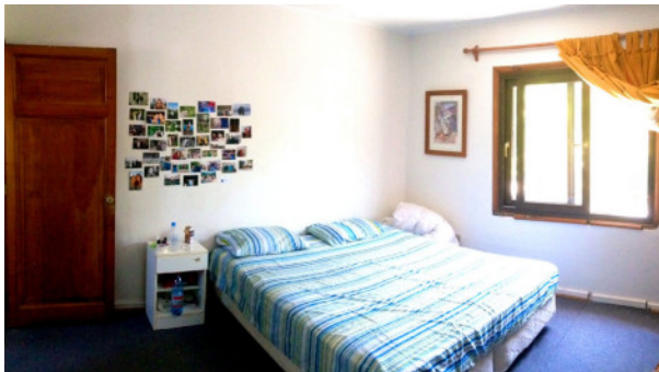
Room for rent